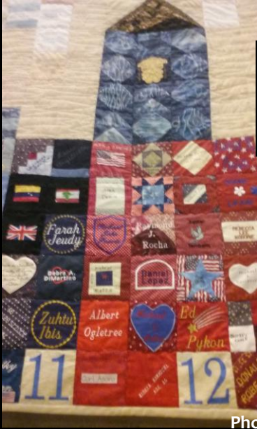
A portion of the quilt wall....