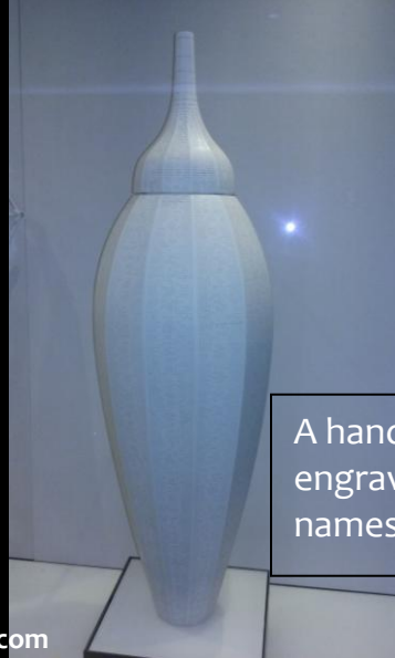
A hand made ceramic urn engraved with all 2,977 names of those lost...